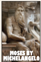
MOSES BY MICHELANGELO

TO HAVE PEACE, GROW IN FAITH BY REMEMBERING TO TRUST THE HEAVENLY FATHER! As Joshua gazed out across the valley to the city, he reminisced across the centuries—buildings change, clothing changes, but can man change? Man fails to learn from the experiences of past generations. In spite of all the knowledge amassed through the ages, people would rather learn from their own limited experiences, so their responses and decisions to life's circumstances never change. Man has no memory of the past. Yet it is memory of past experiences that should shape our responses and decisions, which determine patterns of human growth. Is man doomed to invent ever more sophisticated technology, but never grow and comprehend how to control them and have peace? Joshua thought about his own place in the long-term plan of his Father, and about the complex course He laid out through which humanity would evolve— grow in faith . Often he felt alone without a family, but kept a happy attitude toward earthly life, looking to distant goals rather than immediate satisfactions, realizing that in spite of appearances, his Father's will would ultimately triumph. He was here for a purpose, designed by Him. At night he knelt by his bed, praying with an open heart to His Father, who was intimately involved in his life, controlling the circumstances, making the decisions. Sometimes Joshua disagreed with them, but he was not afraid to trust His Father, abandoning himself completely to His will.