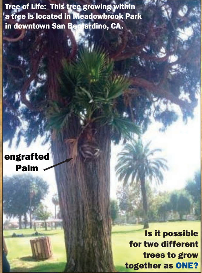
Tree of Life: This tree growing within a tree is located in Meadowbrook Park in downtown San Bernardino, CA.

Is it possible for two different trees to grow together as ONE?